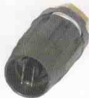
VAN - Variable Spray Angle Nozzle

MAX. FLOW : 21 LPM PRESSURE : 250 Kg/Cm 2