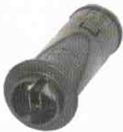
High Low Nozzle

MAX. FLOW : 42 LPM PRESSURE : 250 Kg/Cm 2