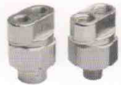
Double Nozzle Holder