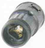
Three Way Nozzle

MAX. FLOW : 21 LPM PRESSURE : 250 Kg/Cm 2